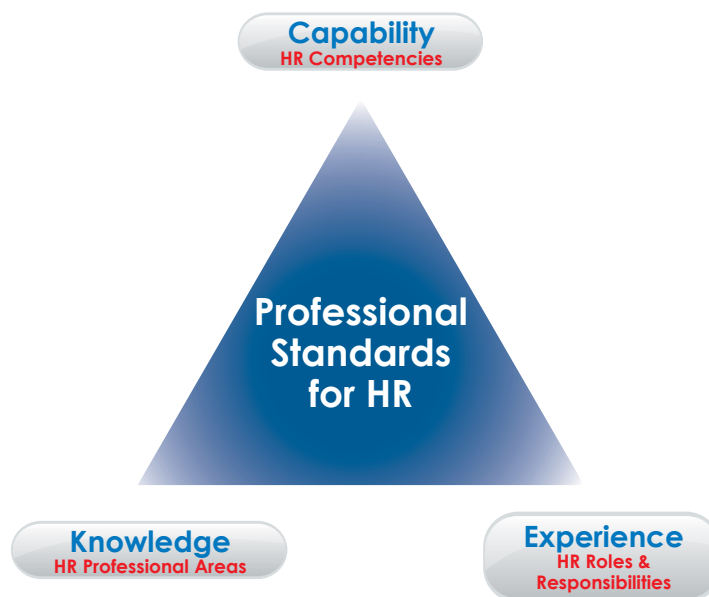
HKIHRM HR Professional Standards Model