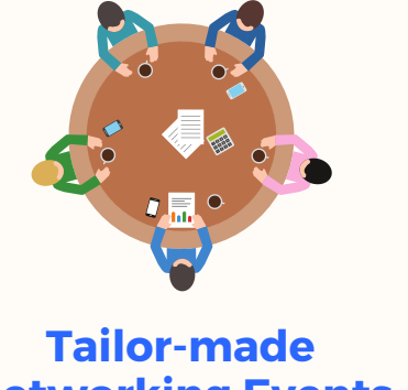
Tailor-made Networking Events for targeted HR Leaders