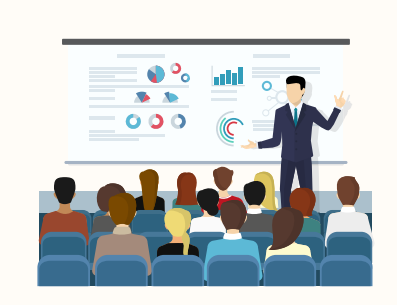
Branding / Speaking Opportunities at Signature Events